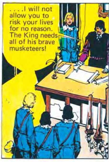
De Treville told the three men to go, then turned to d'Artagnan.