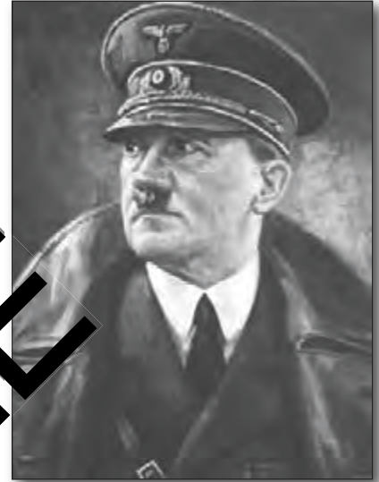
Adolph Hitler 1889-1945

A dictator is a ruler who has absolute power. A dictatorship government is ruled by a dictator. Dictatorship governments are usually the result of military rule after a war or a conflict. They usually rise to power in an emergency situation where the people are eager for a leader. Dictators are often military leaders who were active leaders during the war or conflict.