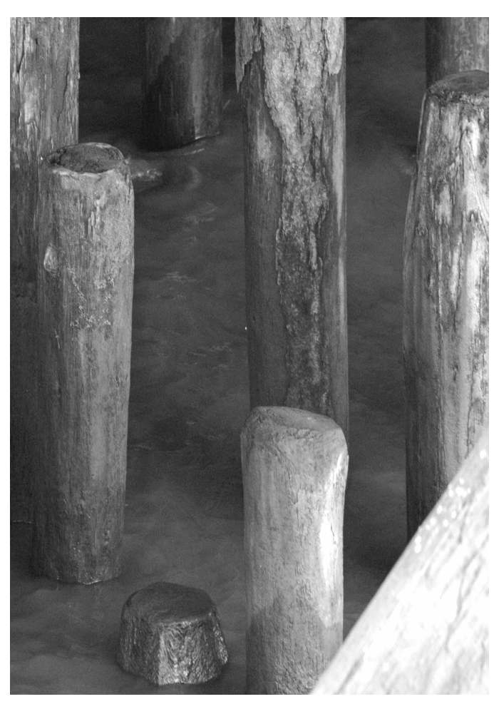
Then the tops of the poles were sawed off.