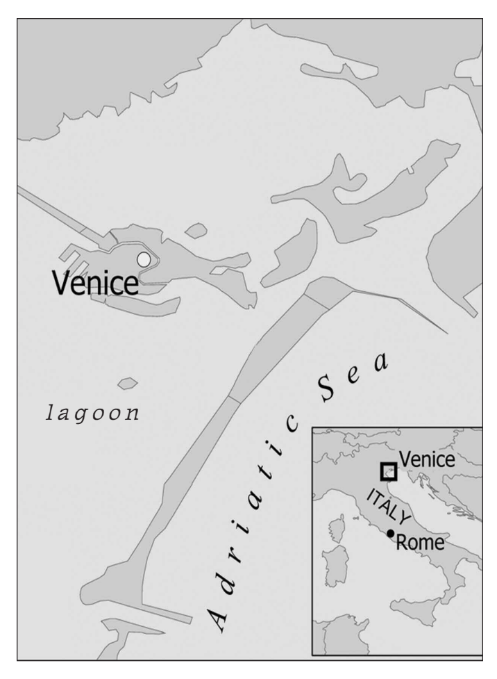
Venice was in a good spot. It was by the sea.