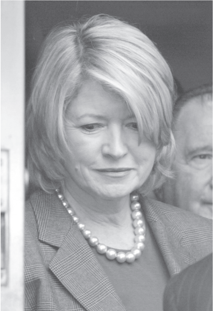
Martha Stewart leaves a hearing at federal court in New York.