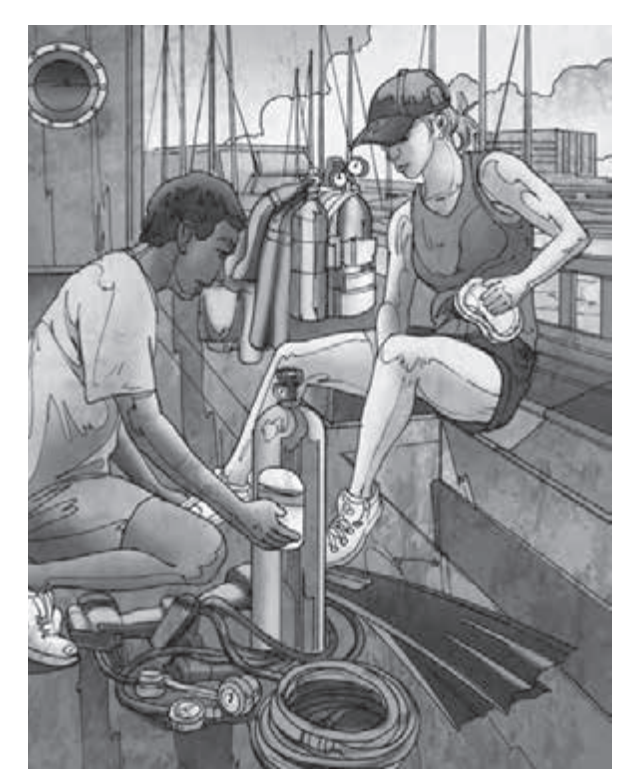
There were masks and tanks set out on the deck of the big boat.

"I bet there is an old ship by that reef," said Trish as they drove to