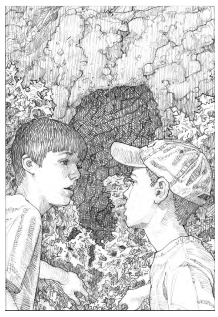
"Look at that," Tom said. There was a hole in the hill.