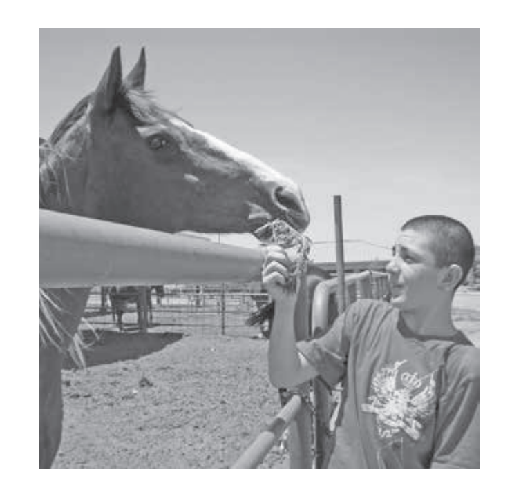
I see a boy and a horse.