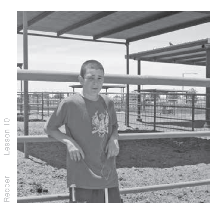
See a boy.