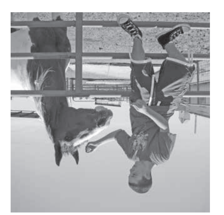
See a porse.