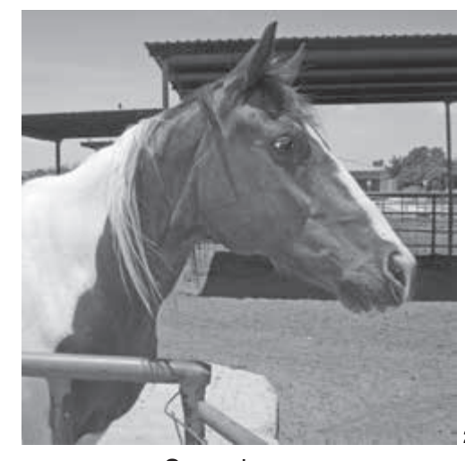
See a horse.