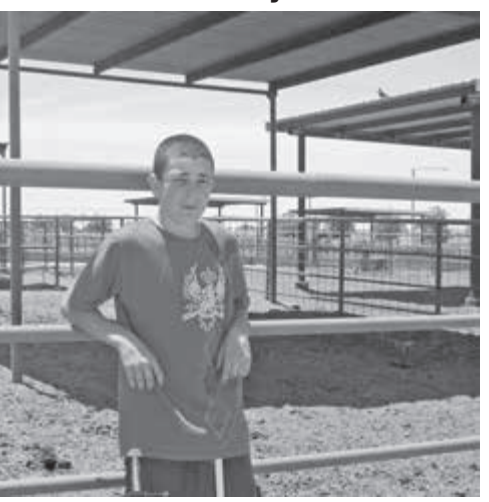
See a boy.