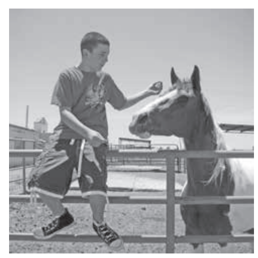
See a boy and a horse.