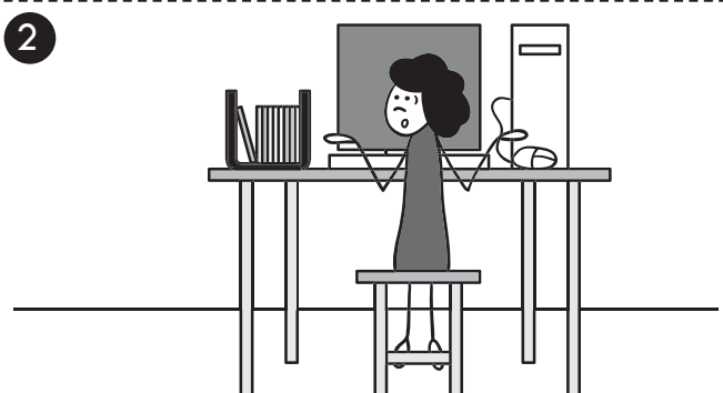
Molly likes to use the ART CD to make colorful pictures on the computer. Molly looks through the CDs, but she can't find the ART CD.