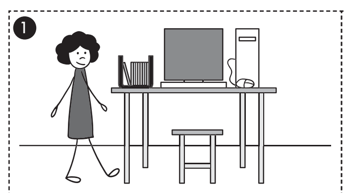
There are two computers in Matt and Molly's classroom. It's Molly's turn to use one of the computers today.

Cut out the pictures. Read the text below picture number one, pointing to the words as you read them. Then lay the picture on the table. Do the same for picture number two and picture number three. Next, ask the WHY question. Show your child picture number 4a and picture number 4b and ask him to choose one. He may tell you his choice, point to it, or touch it with an unsharpened pencil. After your child chooses a picture, say, "Good choice!" Then read the text for that picture and lay the picture on the table. Finally, retell the entire story one more time. For added fun, act out the story with your child!