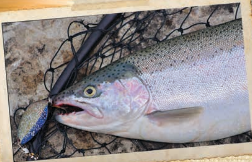
CATCH OF THE DAY