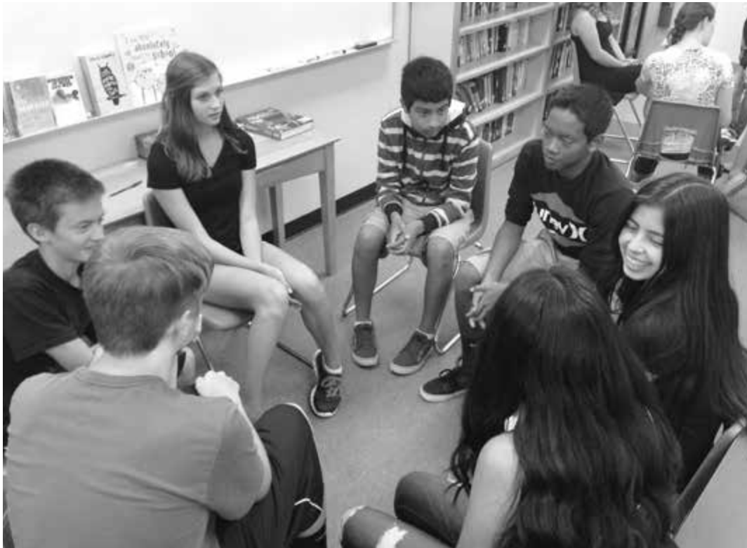
Students engaged in small-group student-led discussions called Four-Corner Conversations.

conversations, including teacher led, student led, one-on-one, small group, and large group. They should discuss texts and real-world issues with a range of partners to ask questions, build on other students' ideas and express their own thoughts "clearly and persuasively" (National Governors Association Center for Best Practices & Council of Chief State School Officers, 2015).