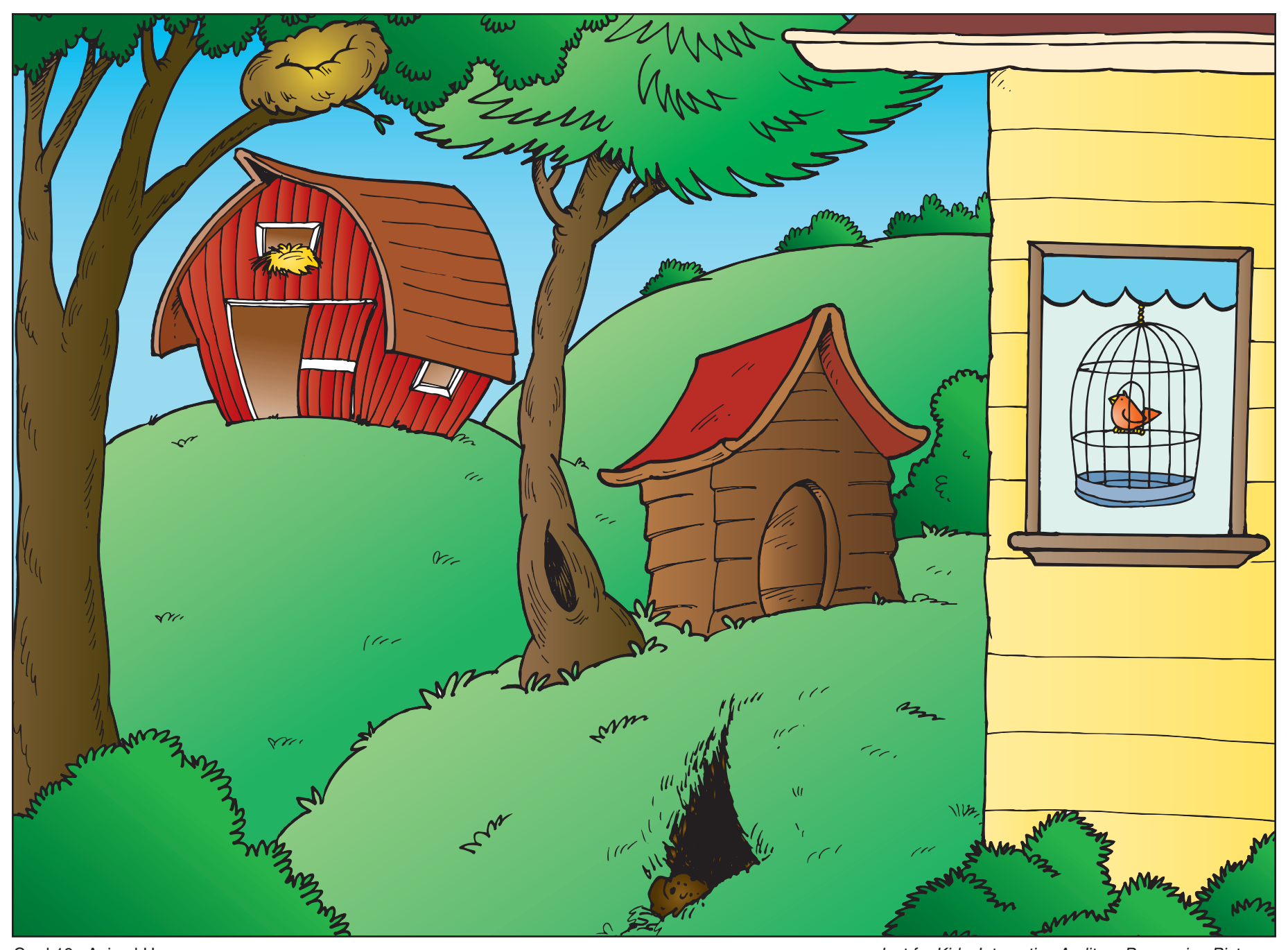
Card 19: Animal Homes inside/outside