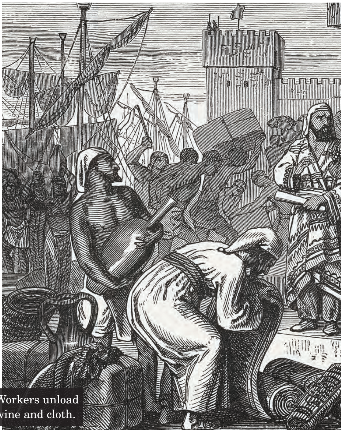
Workers unload wine and cloth.