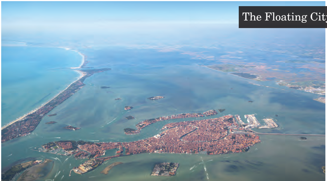
The Floating City

An army marched over the land for many miles. Then they came to the Floating City. They wanted to attack. They could not. They were stopped by water. They had no boats.