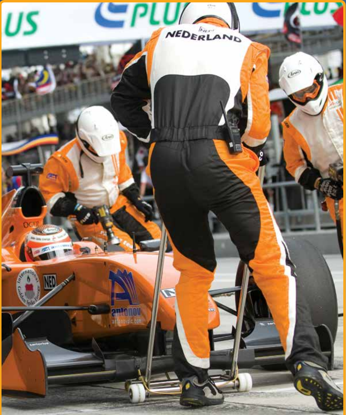
People at both ends of the car work the jacks.