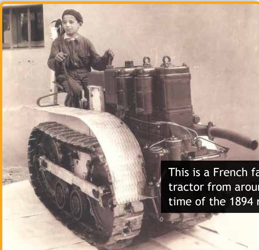
This is a French farm tractor from around the time of the 1894 race.

The top speed was 10½ miles an hour. A farm tractor came in first. Even so, the tractor didn't win the grand prize. It wasn't a car!